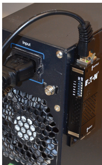
Eaton EMP Gen 2 installed on UPS

1. Due to continuing improvements, specifications are subject to change without notice.