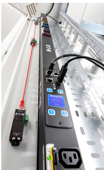
Eaton EMP Gen 2 daisy chained on rack PDU